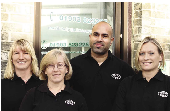
The Worthing Supervisory Team

Together, we are working towards a common goal of offering people worthwhile and sustainable employment.