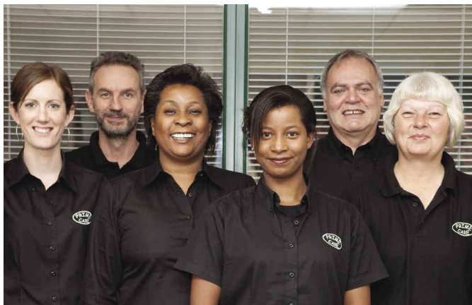
The Hastings Supervisory Team

AND LAST, BUT NOT LEAST... Hastings is at the end of our coastline but has proven to be a fast-growing dynamic new team, extending our services to the Kent border.