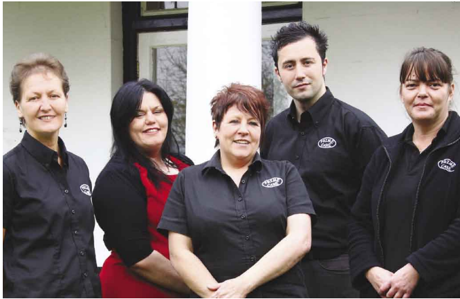
The Hampshire Supervisory Team