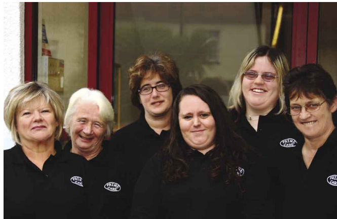
The Bournemouth & Poole Supervisory Team