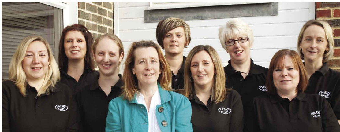
The Seahaven Supervisory Team