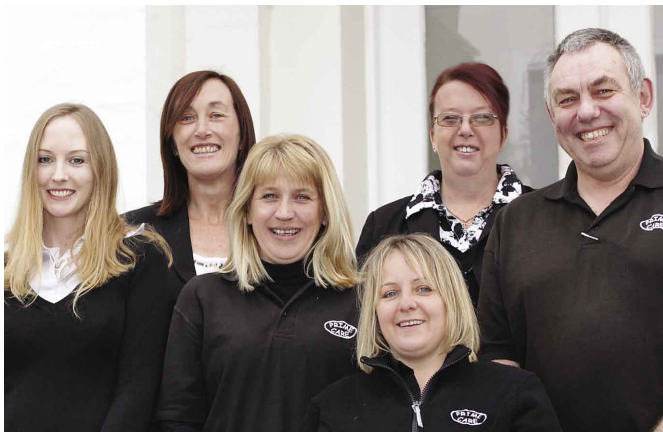
The Eastbourne Supervisory Team

OUR END OF LIFE CARE e-learning training programme allows our care workers to complete certificated courses on a computer. This training is intended to complement and support a variety of learning experiences at work specifically focused on the social care role at the end of life. This advanced learning will ensure social care staff deliver the highest quality of personalised care planning support for people who are nearing the end of their life to enable them to live as well as they can, for as long as they can.