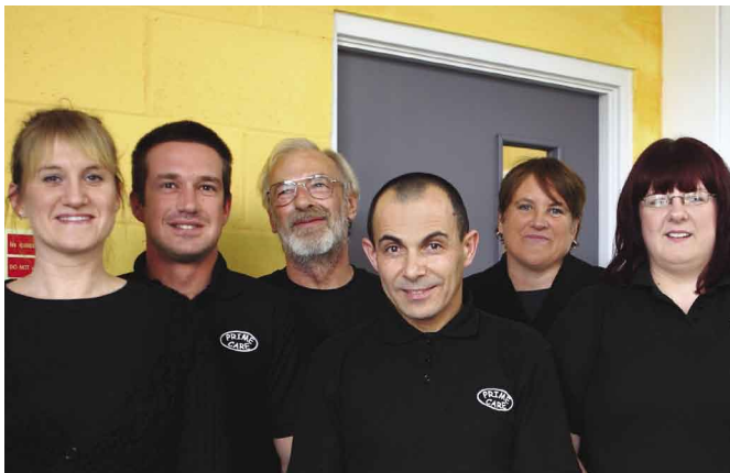
The Brighton & Hove Supervisory Team